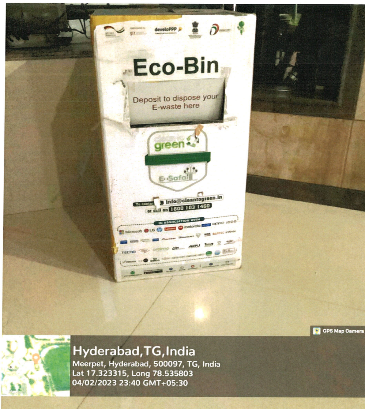
E-Waste Bins are installed in Campus