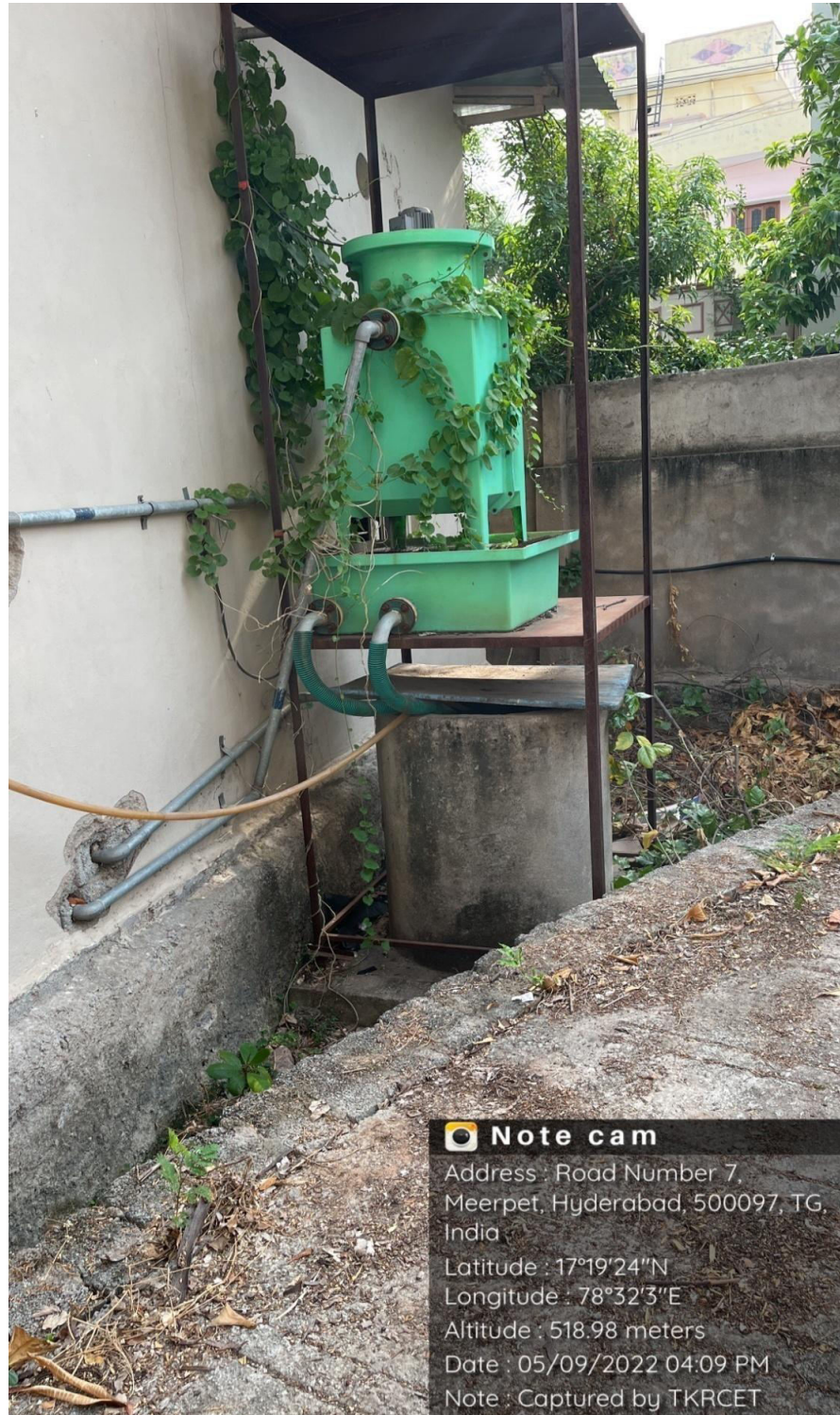
Solid waste management