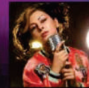
Hard Kaur 2012