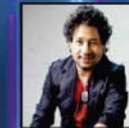
Kailash Kher 2010