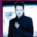
Edward Maya 2014