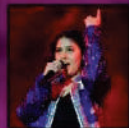
Sunidhi Chauhan 2019