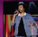
Nakash Aziz 2018