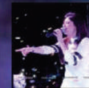
Kanika Kapoor 2016