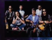
Parikrama Band 2008