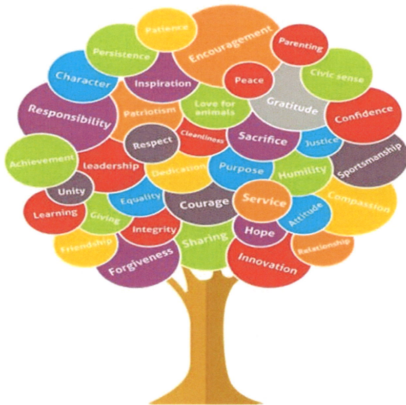
A TREE OF CHARACTER DEPICTING HUMAN VALUES

Ethical egoism supports the view that the right action consists in producing one's own good. Ethical relativism supports the view that the right action is merely what the law and customs of one's society requires. A professional is expected to support ethical relativism.