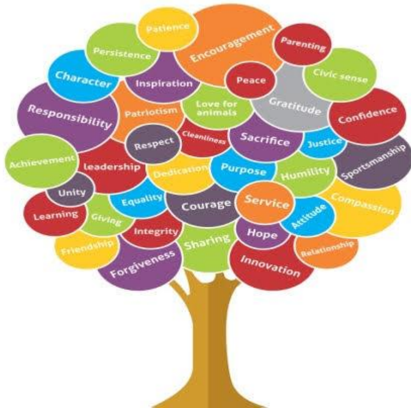
A TREE OF CHARACTER DEPICTING HUMAN VALUES

Ethical egoism supports the view that the right action consists in producing one's own good. Ethical relativism supports the view that the right action is merely what the law and customs of one's society requires. A professional is expected to support ethical relativism.