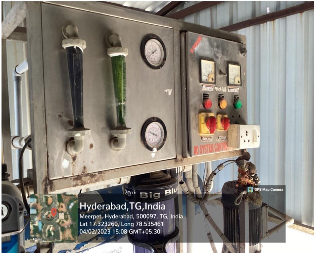
RO Water System Control