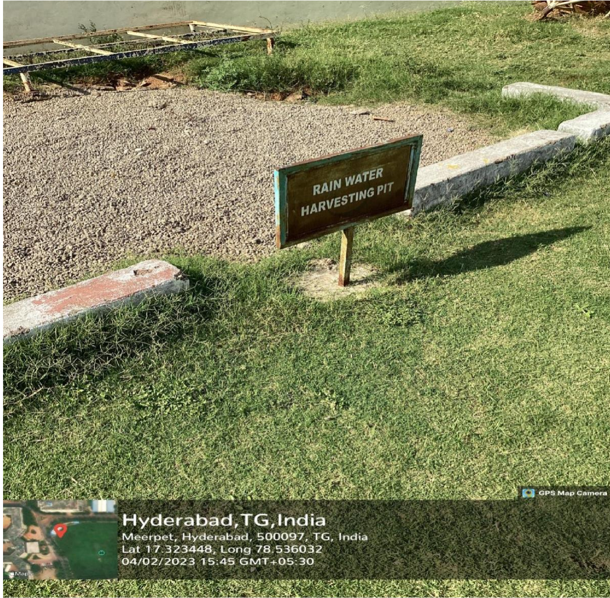
Rain Water Harvesting PIT