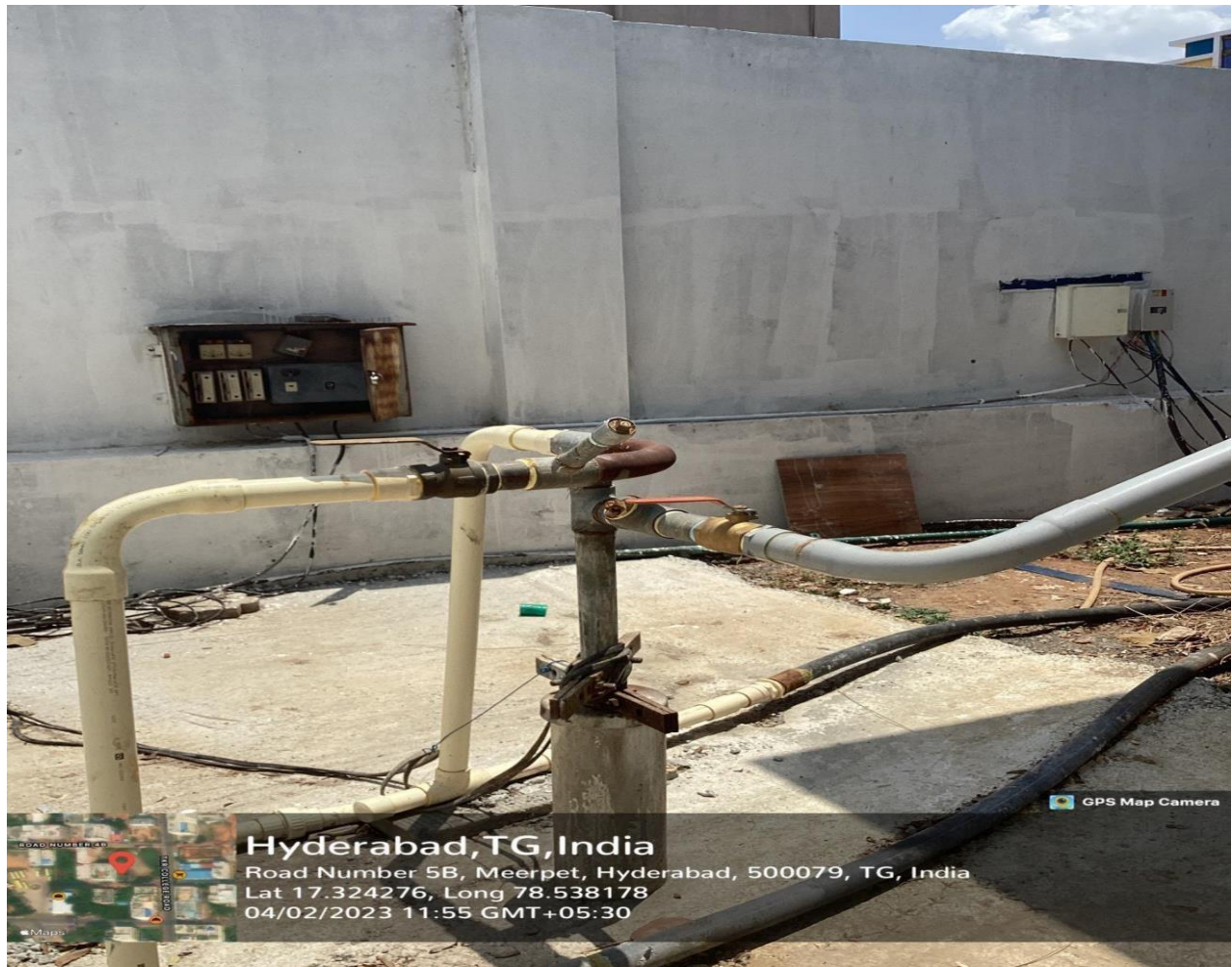
Bore well for groundwater within campus