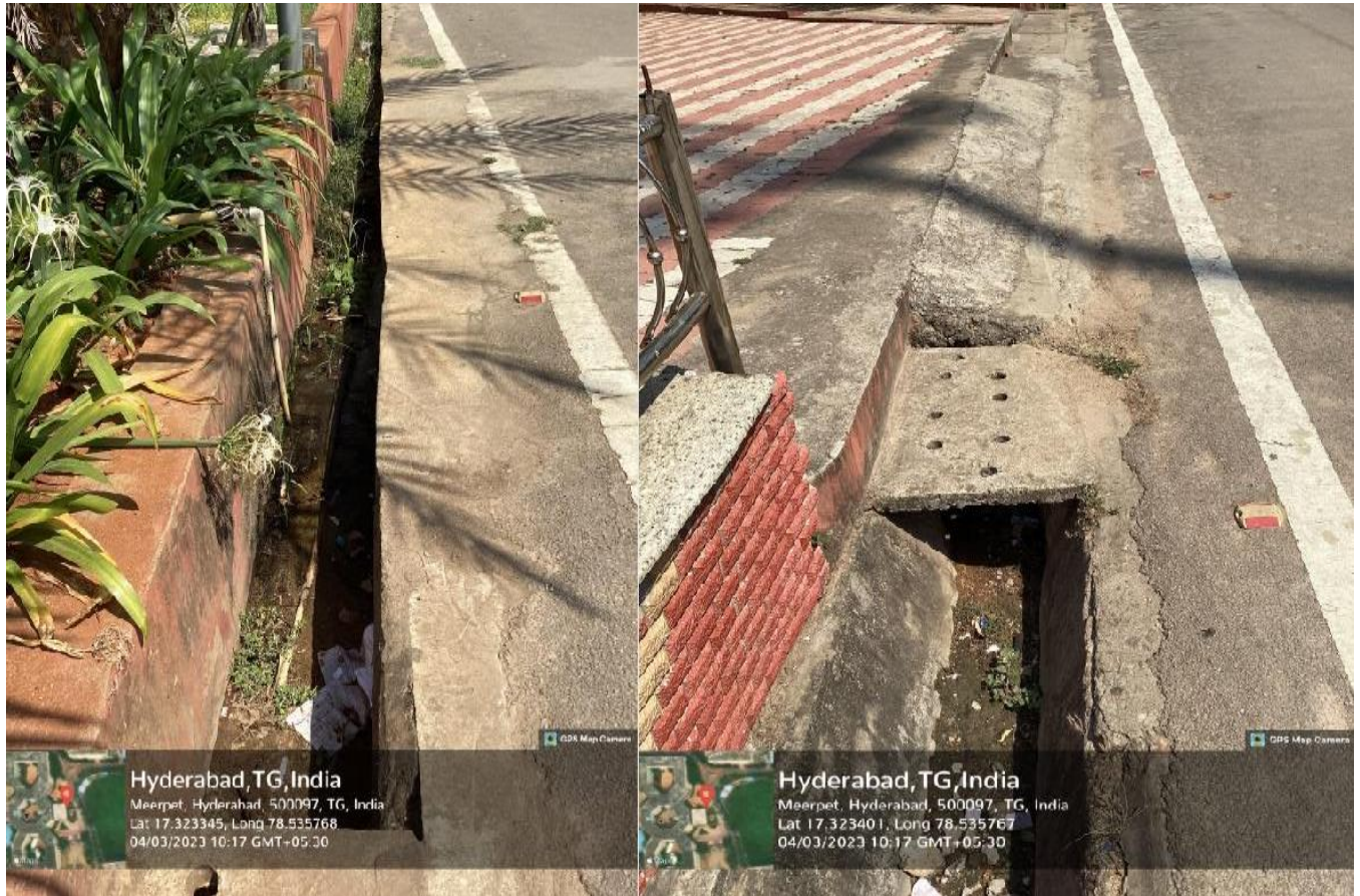
Water Channels in campus for rain water management