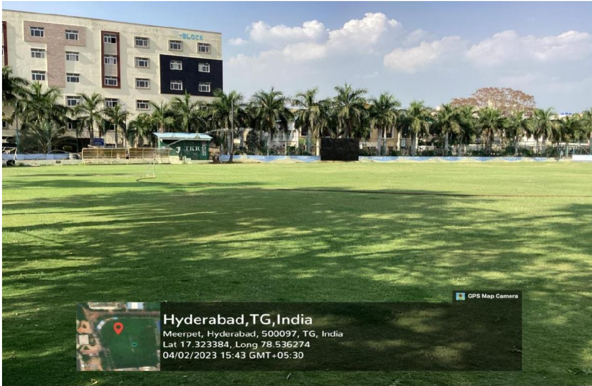
Recycled Water used for cricket ground through water sprinklers