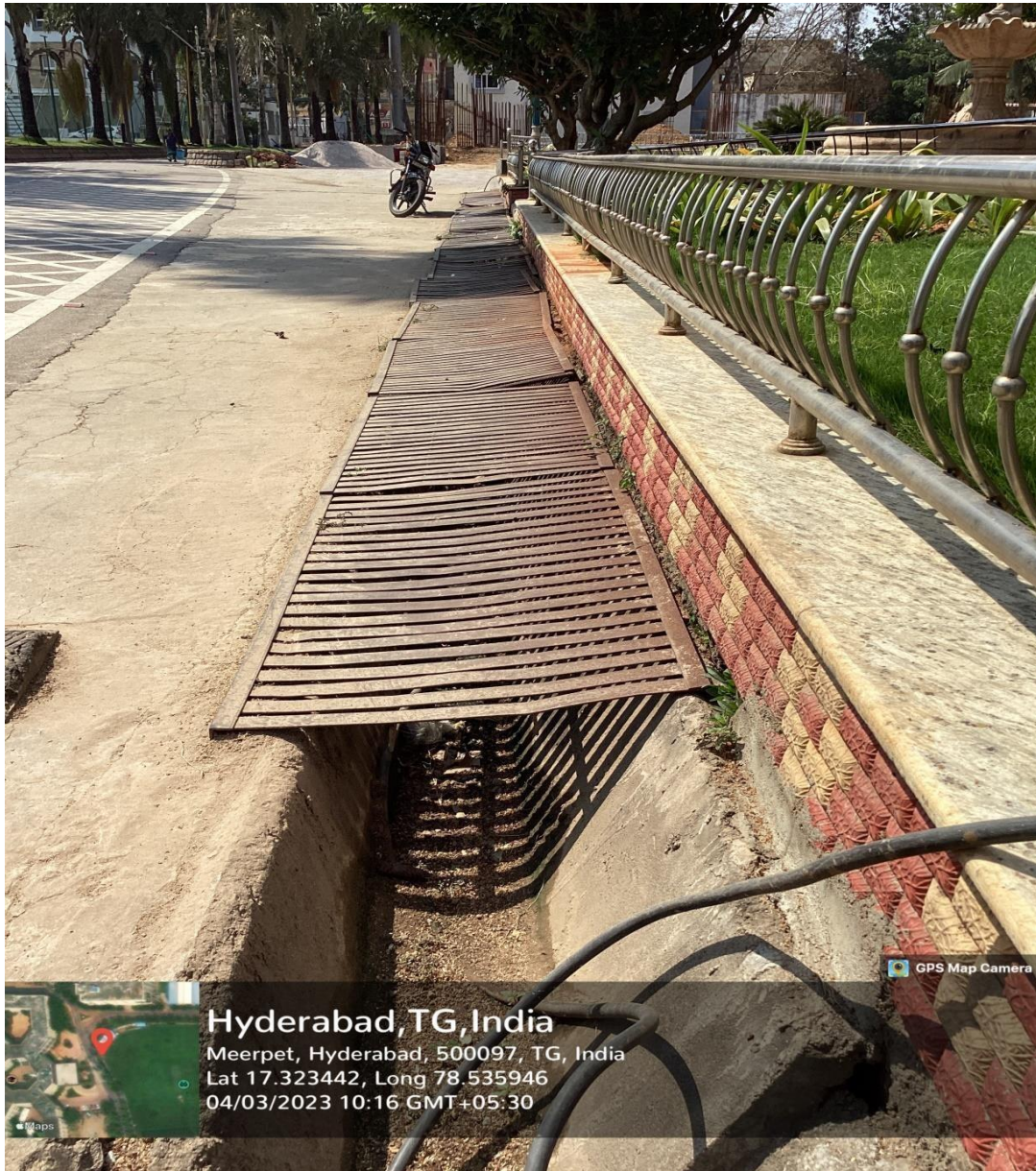
Water Channels in campus for rain water management