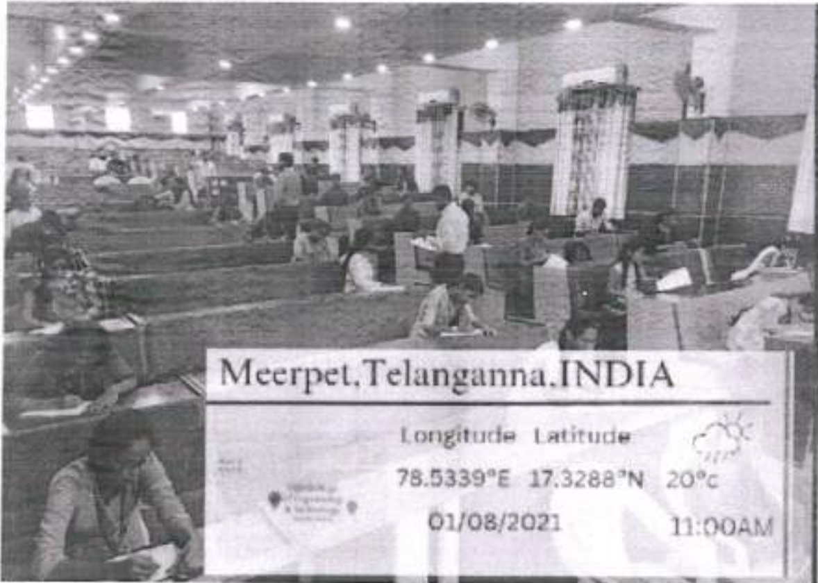
Students Eassy Writing