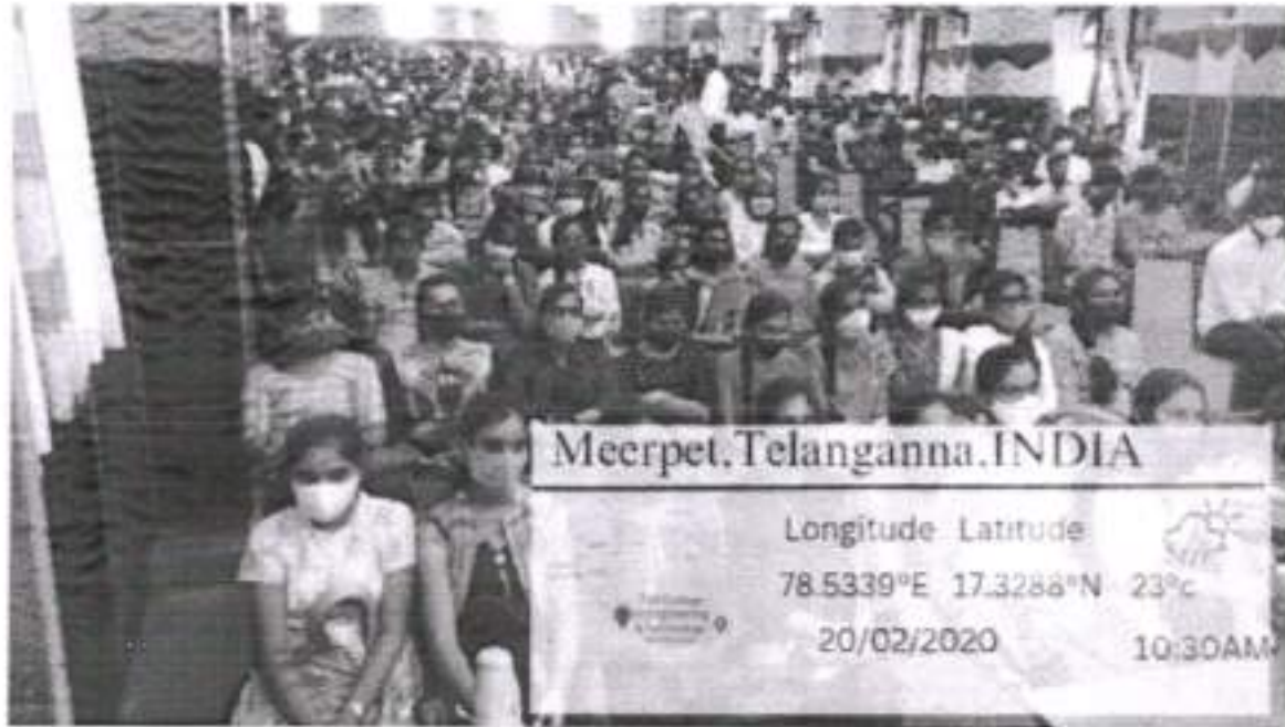
Students in Science Day Celebrations

PRINCIPAL TKR College of Engineering & Technology (AUTONOMOUS) Medbowli, Meerpet, Hyderabad-500097.