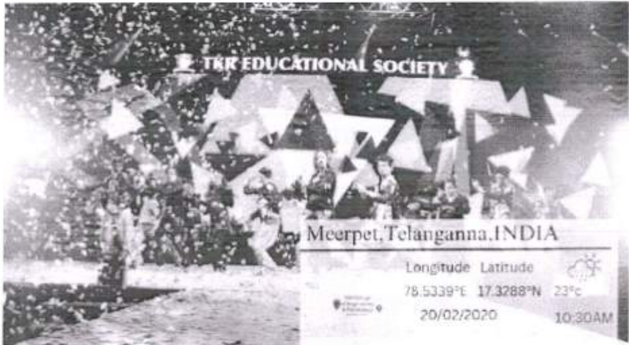
Students performing Group Dance