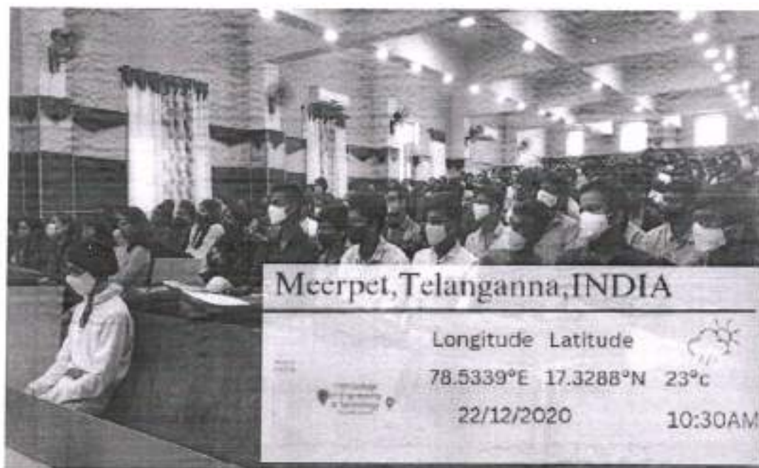
Mathematics Day celebrations in Auditorium

National Mathematics Day is celebrated every year on December 22 across the nation to recognise and celebrate the works of Srinivasa Ramanujan. It was on this day in 1887, the Indian mathematical genius Srinivasa Ramanujan was born. The mathematical genius Ramanujan was born to a Tamil Brahmin Iyengar family at Erode, Tamil Nadu. The former Prime Minister Manmohan Singh, on February 26, 2012, declared December 22 as the National Mathematics Day to mark the mathematician's birth anniversary. The National Mathematics Day is celebrated across the country with several educational events in schools and colleges.