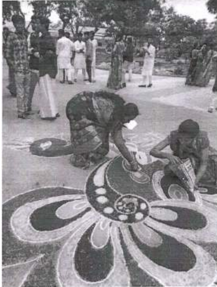
Staff in Rangoli Competition

PRINCIPAL TKR College of Engineering & Technology (AUTONOMOUS) Medbowli, Meergat, Hyderabad- 500097.