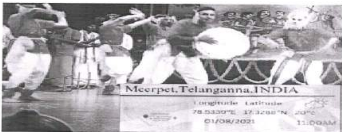
Students performing Folk dance