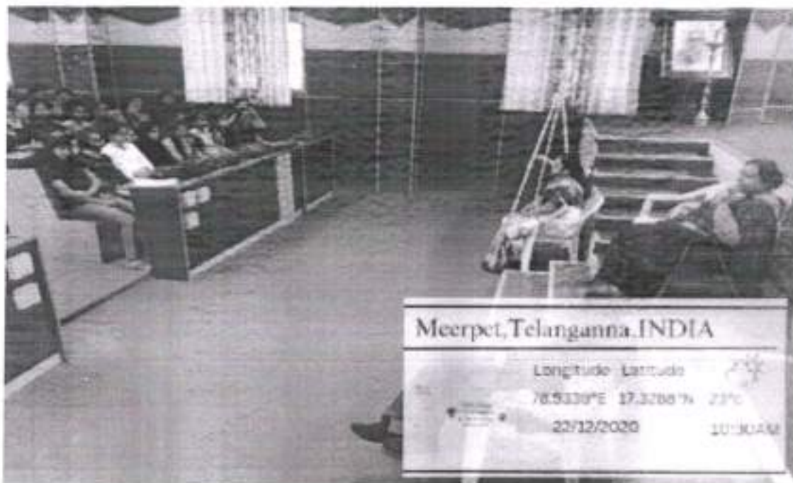
Mathematics Day Celebrations in TKRES Auditorium